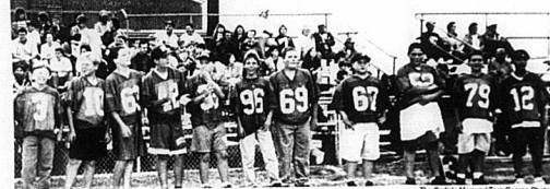
The Nicholas County Junior High Seventh Grade Bluejackets were recognized during half-time at the Paris Greyhounds game on Friday, Sept. 16 at Nicholas County High School.