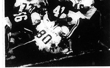
The Nicholas County Bluejackets met defeat against the Raceland Rams last Friday night at Raceland.