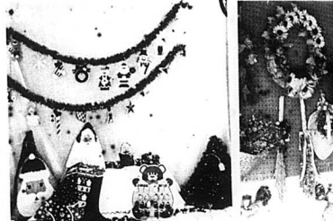
The Carle Mercurly Wreaths and Raffia angels, hat, baskets, dried flower arrangements and many intricate, beautiful crafts were shown at the Fall Boutique & Christmas Preview held Sept. 29-30 and Oct. 1 on Hickory Ridge.