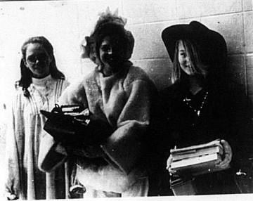
The Carle Mercury Leigh Stone Photo