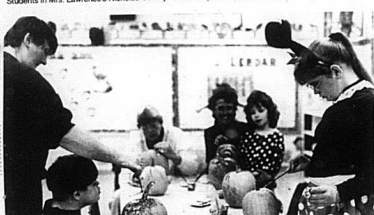
Nicholas County Elementary students and teachers picked up the Halloween spirit with a little pumpkin carving Tuesday, Oct. 31.