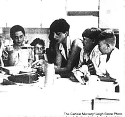
of the Nicholas County students in grades 4-8 about the NCE of cooking.