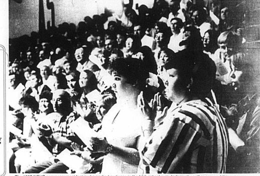
The 1995 NCHS commencement featured a packed audience in the high school gym. Inclement weather occurred this year.