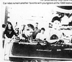
"Coming through" these guys seem to say "What to ride next?"