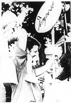
Rides by Snyder & Metz this year provided lots of family oriented fun.