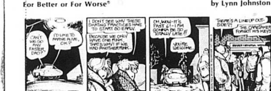
by Lynn Johnston