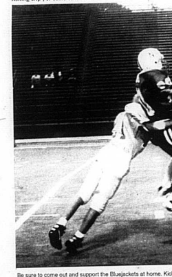
Be sure to come out and support the Bluejackets at home. Kickoff is 8 p.m. Friday night.