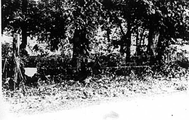
Bicycle and other debris were thrown against this fence during the wind and rain storm Wednesday, Aug. 9 in the East Union Road and Upper Sharpburg Road areas.