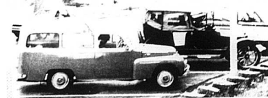
A car show featuring cars of the 1940s was held at downtown Carlisle late Saturday and was enjoyed by many participating in the commemoration honoring World War II veterans.