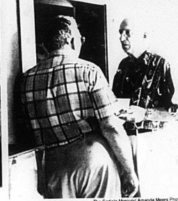
World War II veterans had a chance to talk over old times at The Old Jail both Saturday and Sunday, courtesy of Tourism Inc.