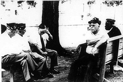
World War II veterans from throughout the state and United States came to Carlisle for the World War II Commemoration Aug. 4-6 at Carlisle sponsored by Tourism Inc. These Georgetown veterans enjoyed a chance to get together, talk, and see war memorabilia.