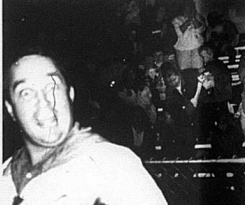
The Bluejackets, despite the loss, are still 2-0 in district play, and tied for first.

Hopkins 3-yard scoring run for the Bluejackets followed. For the Bluejackets, it was definitely with 8 tackles and 5 assists. "I put a few vicious licks on people, but they were strong. I felt like I was bouncing off of them." "I think a lot of the Bobcats were in a bad mood, but the tape made me feel better than I thought I did." The Bluejackets, despite the loss, are still 2-0 in district play, and tied for first.