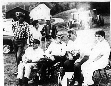
Central Kentucky Foxhunters enjoyed the opportunity to socialize at the annual burgo supper held last Thursday night at Clay Wildlife Management.

UNAPS—American consumers, it's well, have the world's widest choice of new cars and trucks. New, thanks to a new law, American consumers will have simple information about where parts in a vehicle originate and where a vehicle is built. As of October 1, 1994 every car and light truck sold in the U.S. will carry a label that includes: • The U.S. Canadian content of the vehicle's parts, including all material and labor costs. • The top two countries from which 10 percent or more of the vehicle's parts originate outside the U.S. and Canada. • The country of origin of the engine and transmission; and • Where the vehicle was assembled. The American Automobile Labeling Act of 1992 to stimulate consumer confidence over conflicting claims of domestic content of vehicles sold in this country. The new label will provide American consumers, for the first time, with simple, yet detailed vehicle content information. This information will be calculated and presented in a uniform fashion by all auto manufacturers because the same rules apply to all automobiles. According to the U.S. Department of Transportation, the new law is designed to "provide the ultimate purchaser of a new passenger motor vehicle with the best and most understandable information possible about the foreign and U.S./Canada origin of such vehicle." Who benefits the most from the new law? American consumers. Beginning October 1, they'll have easy access to information they did not have before.