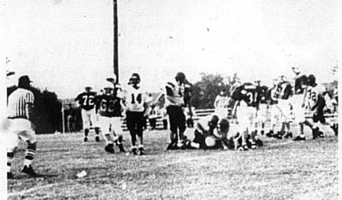
The going got tough during this crack up at the Nicholas County High School football field last week when the junior high teams of Nicholas County defeated Powell County. Many parents and fans turned out to show support.