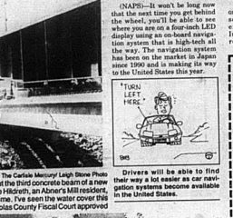
The Caroline Memorial Log Home Photo Shop construction site. A large structure is being built on a hillside.