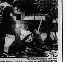
The Caroline Memorial Log Home Photo Shop construction site. Workers are handling large concrete beams.