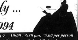
Amy Dawn Fields