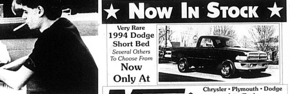
During a blood drive by the Central Kentucky Blood Center in the Nicholas County High School gym on Monday, the 14-year-old student was willing to do his part in the noble undertaking. But beforehand, all donors are required to give medical information including taking temperature.