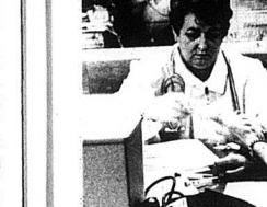
During a blood drive by the Central Kentucky Blood Center in the Nicholas County High School gym on Monday, the 14-year-old student was willing to do his part in the noble undertaking. But beforehand, all donors are required to give medical information including taking temperature.