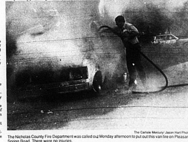
The Nicholas County Fire Department was called out Monday afternoon to put out this van fire on Pleasant Spring Road. There were no injuries.