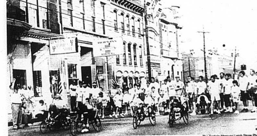
The Annual Nicholas County Chamber of Commerce 5K Race was a big success with many participants. The race is held each morning July 4 on East Main Street in downtown Carlisle. Children get things started with a race of their own around the courthouse. T-shirts are the prizes awarded to runners by the Chamber.