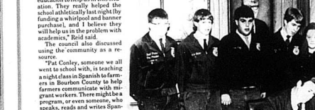
Opel Springs High School football team.