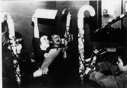
Toys! Candy! Christmas joy! All the goodies were provided for Nicholas County Elementary School youngsters by good-hearted Carlisle Rotary Club members. A pot-together was held at The Old Jail before Christmas.