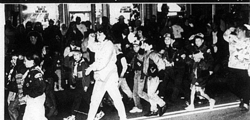
The Annual Nicholas County Lion's Club Snow Queen Parade held Saturday, Dec. 3 on Main Street featured bands and floats and high organizations such as Page 5.