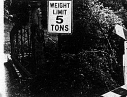
Hinkle Contracting of Paris began work on Abner's Mill Bridge two weeks ago. The old bridge, to the left, will be replaced by a new two-lane structure. The bridge being replaced is estimated to have been built in 1914.