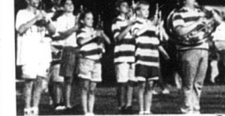
The Nicholas County High School Band struts its stuff, entertaining the crowd during half-time at the first Nicholas County football game.