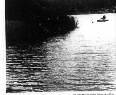
Nothing is more peaceful on a cool autumn day than fishing from a rowboat on Lake Carmichael as this fall fishermen found.