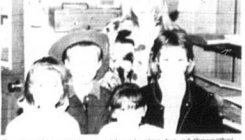
Despite cold temperatures, trick or treaters braved the weather.