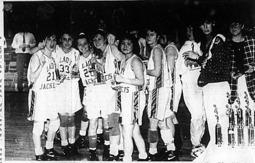
The 1992-93 Nicholas County Lady Jackets will be playing at Farnham Dudgeon Civic Center in Frankfort March 24-27. They won the 10th Regional Tourney once again Tuesday night with a 46-35 win over Harrison County.