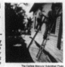
The Carlisle Memory Bank Volunteers work on painting the Bartterville United Methodist Church.