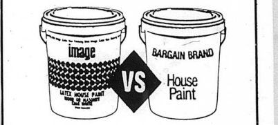
IMAGE PAINT Saves Money On Labor Good Paint (IMAGE) Will Last Much Longer Than Cheap Paint