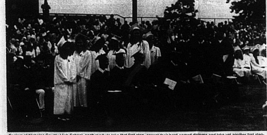
Seniors of Nicholas County High School, each ready to take that first step, accept their hard-earned diploma and take yet another first step—as Graduates of the Class of 1993.