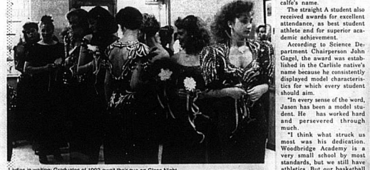
Ladies in waiting. Graduates of 1993 await their cue on Class Night.