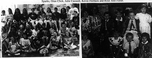
1993 Senior Drama Club Members