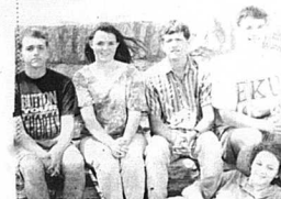
1993 Senior Pep Club Members