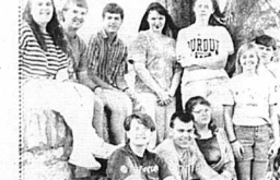
1993 Senior Drama Club Members