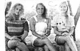
1993 Senior Ecology Club Members