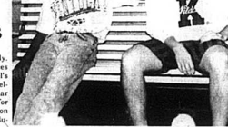
1993 Academic Team Seniors