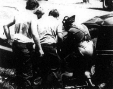
Nicholas County fire fighters work to remove an accident victim from his vehicle last week. Fire fighters used the "Saws of Life" to cut away the door of the car to allow his removal and treatment.

Everyone is familiar with "primary care" provided by doctors; treatment for cuts, bruises, sore throats, etc. The mission of your local health department is to prevent health problems by preventing them. The Nicholas County Health Department provides a variety of services, from vaccinations to blood pressure checks. Call them today at 289-2188 or just to thank them for their service to the community.