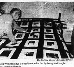
The Carlisle Memory/Subject