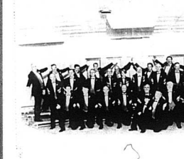
The Kentuckians Barbershop Chorus