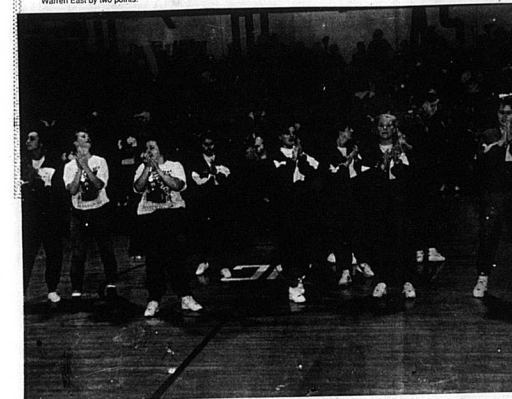
The Lady Jacket cheerleaders were winners at state as well, taking home a state pep award to remember their important role in the Lady Jacket's success.