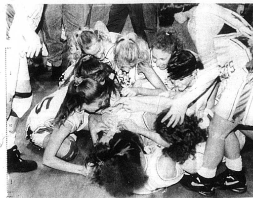
The Lady Jackets fall together in a pile after realizing they were the official winners of the 1993 Girls' Sweet Sixteen after beating Warren East by two points.