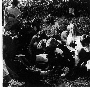
The Nicholas County Band performed at halftime of the Carlisle-East Carter football game Saturday night. The performance was the finale for the marching band for the football season. The band will travel to Carroll County on Saturday for the final marching competition of the year.

all ways for oncoming cars, and never between parked cars. • If possible, send an adult or older sibling with children on trick-or-treat rounds. Always walk, never run. • If driving trick-or-treaters to homes, avoid making sudden stops and watch for oncoming cars when pulling out of driveways. • Take off your mask before crossing a street and look for oncoming cars.