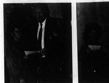
The Lions Club Christmas Parade scheduled for December 5, 1992, will feature a float with a check to be used on the new range and refrigerator in the old jail.

Lions Club Christmas Parade scheduled for December 5