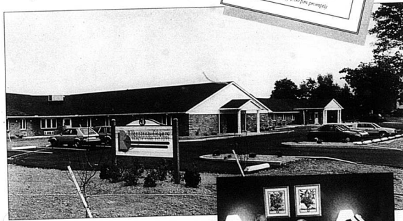
Experience the finest and most modern nursing care facility in the north central Kentucky area. You will immediately realize the care of superior medical care, personal well-being, and enjoyable community life.

Modern care, companionship, and gracious living is waiting for you in the area's finest nursing home facility.