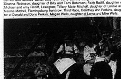
Carlisle Baby Show, three to six months, girl, photo of three children sitting together.