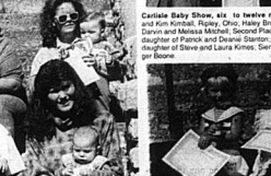
Carlisle Baby Show, three to six months, girl, photo of three children sitting together.