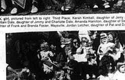
Carlisle Baby Show, three to six months, girl, photo of three children sitting together.