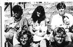
Carlisle Baby Show, three to six months, girl, photo of three children sitting together.