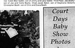
Carlisle Baby Show, three to six months, girl, photo of three children sitting together.