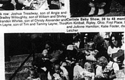
Carlisle Baby Show, three to six months, girl, photo of three children sitting together.