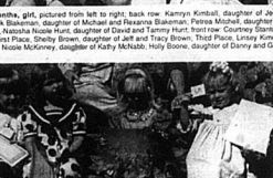
Carlisle Baby Show, three to six months, girl, photo of three children sitting together.