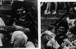
Carlisle Baby Show, three to six months, girl, photo of three children sitting together.