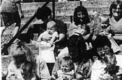
Carlisle Baby Show, three to six months, girl, photo of three children sitting together.