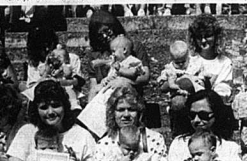
Carlisle Baby Show, three to six months, girl, photo of three children sitting together.