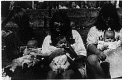
Carlisle Baby Show, three to six months, girl, photo of three children sitting together.