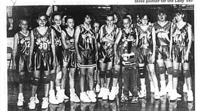
1992 Bluegrass Conference Tournament Runnersup The Nicholas County Lady Jackets Eighth Grade Team