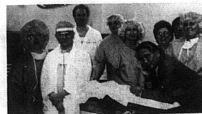
Nicholas County Hospital Surgical Staff