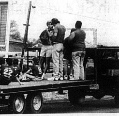
The Nicholas County Life League opened the season with a parade down through the center of Main Street in Carlsle on Saturday morning. Teams returned to the high school to prepare for the opening of the season.