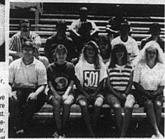
Class of 1992 Future Farmers of America