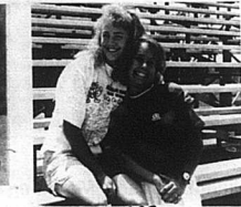
Class of 1992 Girl's Basketball