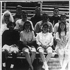
Class of 1992 Newspaper and Yearbook Staff