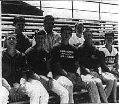
Class of 1992 Boy's Basketball

Wishing to The Class of 1992 The Best of Luck Where Ever Life Takes You To College To Another City To Another State or even To Another Country