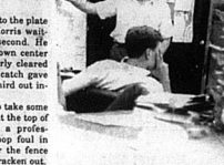
The Centurion Staff Photo

Stacy was able to take some kind of vengeance at the top of the fifth, making a professional snag of a pop foul in left field, just over the fence boundary for the Bracken out.