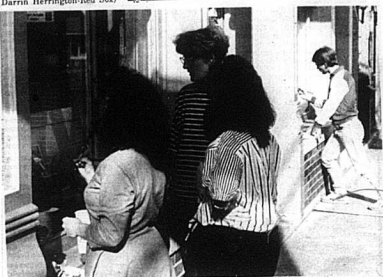
Art students from Elizabeth Collins high school creative arts class engage in creative window painting to support the Nicholas County Bat Jackets bid for the district title during the 37th District Tournament at Nicholas County field last week.