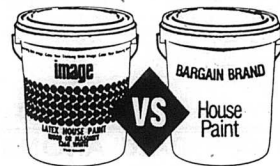
IMAGE PAINT Saves Money On Labor Good Paint (IMAGE) Will Last Much Longer Than Cheap Paint