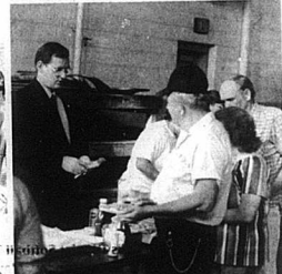
Sixth Congressional democratic primary candidate, Lexington Mayor Scotty Basler, paid a visit to Carleisle for a fund raiser and high fry at the Nicholas County Armory. Basler will return to Nicholas County May 22 on a final 19 county tour of the district to secure the democratic nomination.