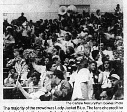
The majority of the crowd was Lady Jacket Blue. The fans cheered the Lady Jackets to the teams first school victory in the state tournament. Pictured below the sign appeared at the Nicholas County Board office as the team arrived back in the Nicholas County after the girls Sweet Sixteen.