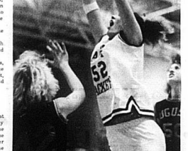
The Carlisle Military Post, Fort Irwin, Calif. is the site of the 37th District tournament. The Nicholas County Blue-Jackets and Paris Thunder won the 37th District tournament.