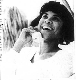
Now It Costs Less To Surprise An Old Friend. We've got good news for South Central Bell customers. We're reducing our long distance rates to nearby communities an average of 30%. So go ahead, surprise your friends. Call them long distance today. For less.