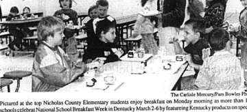
At the top Nicholas County Elementary students enjoy breakfast on Monday morning as more than 100 school children National School Breakfast Week in Donkey March 2-4 by featuring Kentucky products on special

Continued from Page 1. The folks who want to live there and who will make use of that empty space out there," Hutton said.